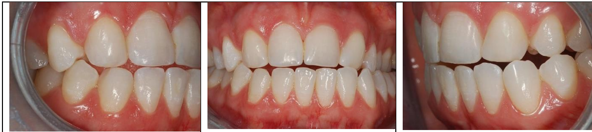
Post treatment retracted view