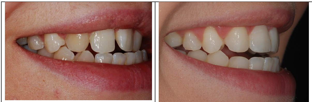
Pre and post treatment views