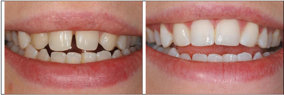
Pre and post space closure