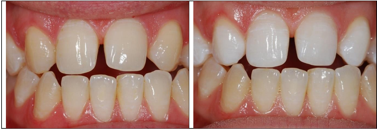
Pre and post whitening