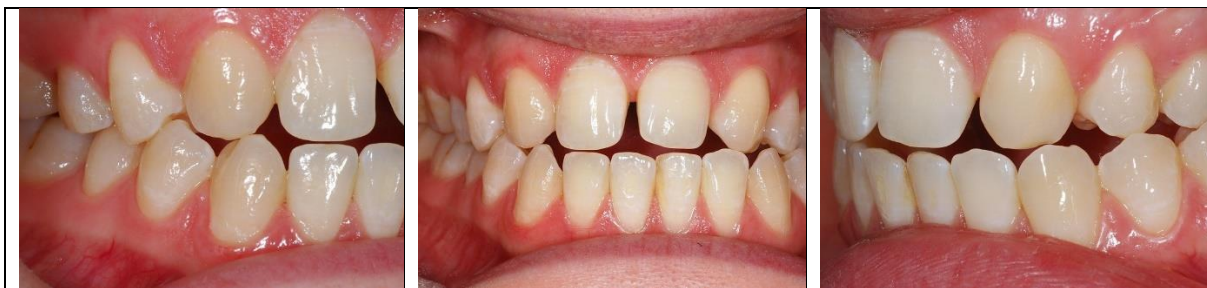
Retracted view prior to treatment