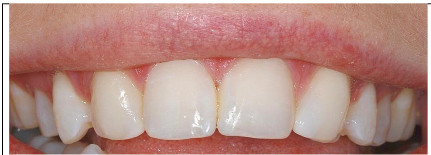
Close up view