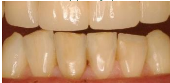
Photo credits: Case A courtesy of GC – all other clinical cases courtesy of Dr Tom Bereznicki